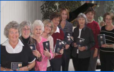
Book Club / Author Event